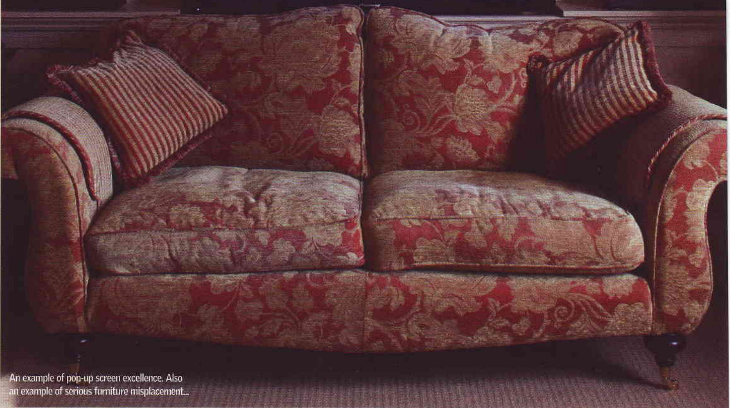
An example of pop-up screen excellence. Also an example of serious furniture misplacement...