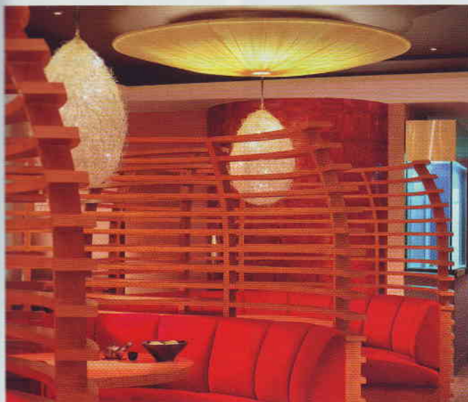
The restaurant's dining 'pods'