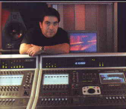
ROLLING STOCK DUBOLOGY GOES MOBILE IN OZ