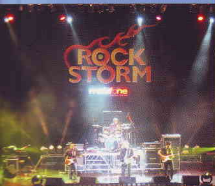
HANOI ROCKS SOUND AND LIGHT IN VIETNAM