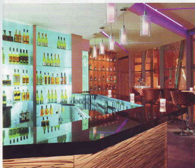
Stylish throughout – the bar

the name suggests, the Amina speakers are actually plastered into the wall or ceiling. The installation process requires them to be mounted within a plasterboard opening in a wall or ceiling, and then skimmed over with plaster ready for decoration. The process is equally simple for solid walls.