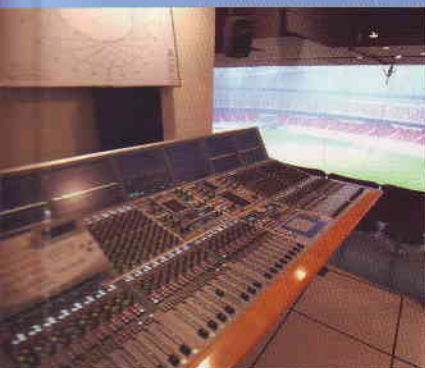
GAME PLAN BROADCASTING FROM BEIJING